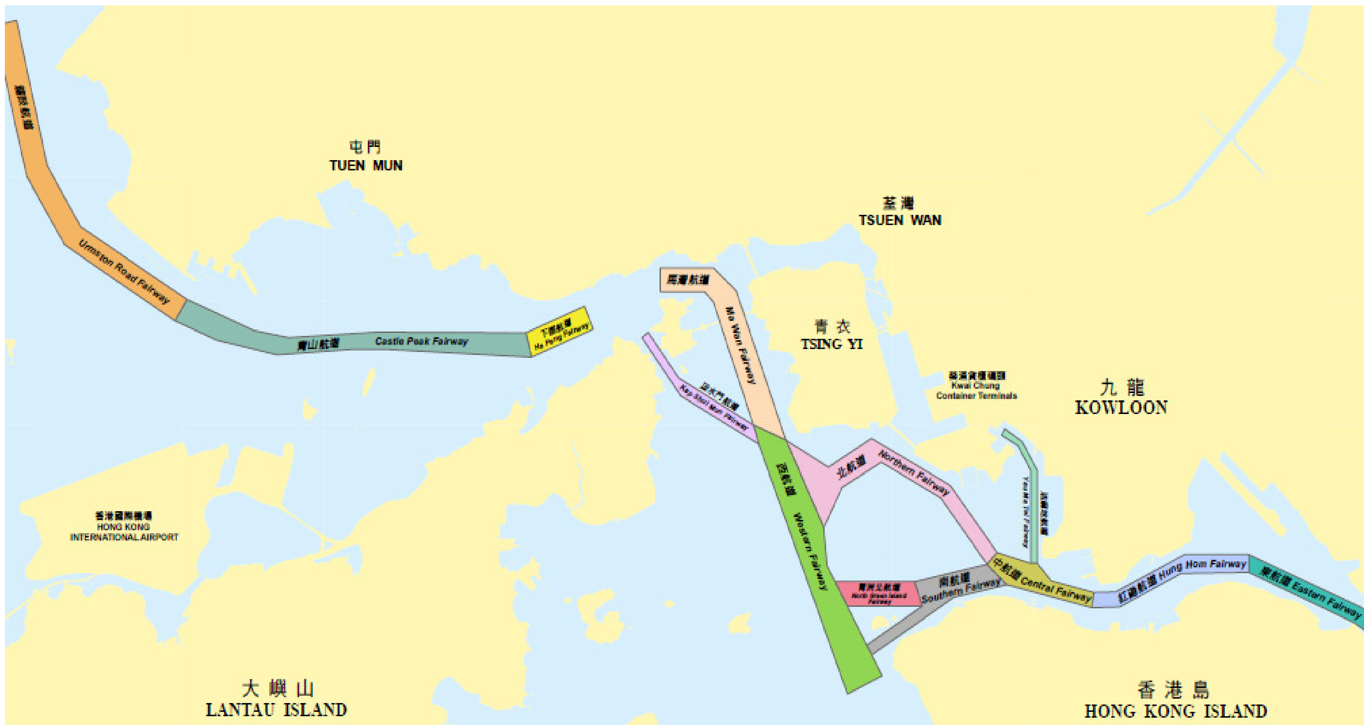
Figure 1b Existing Fairway Plan