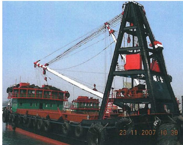
Flat Top Barge