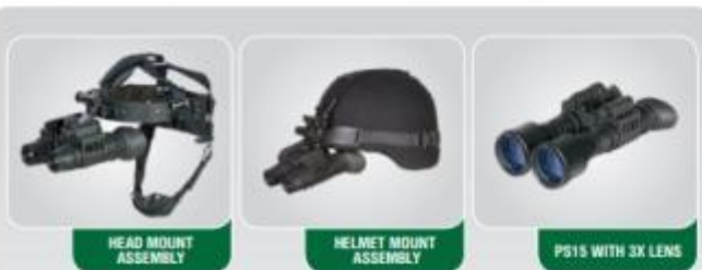
HEAD MOUNT ASSEMBLY