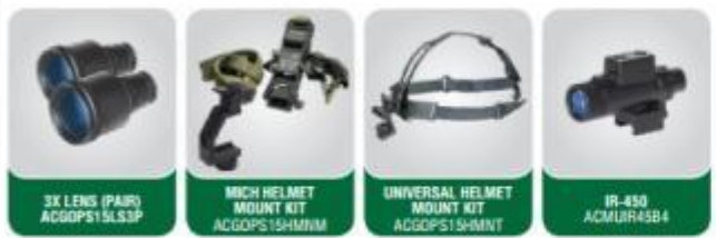
3X LENS (PAIR) ACGOPS15LS3P