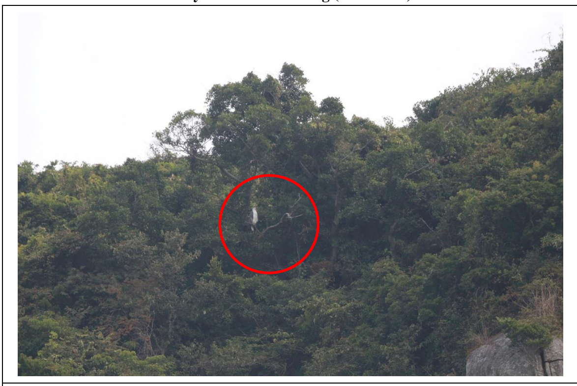
Adult WBSE recorded in Shek Kwu Chau