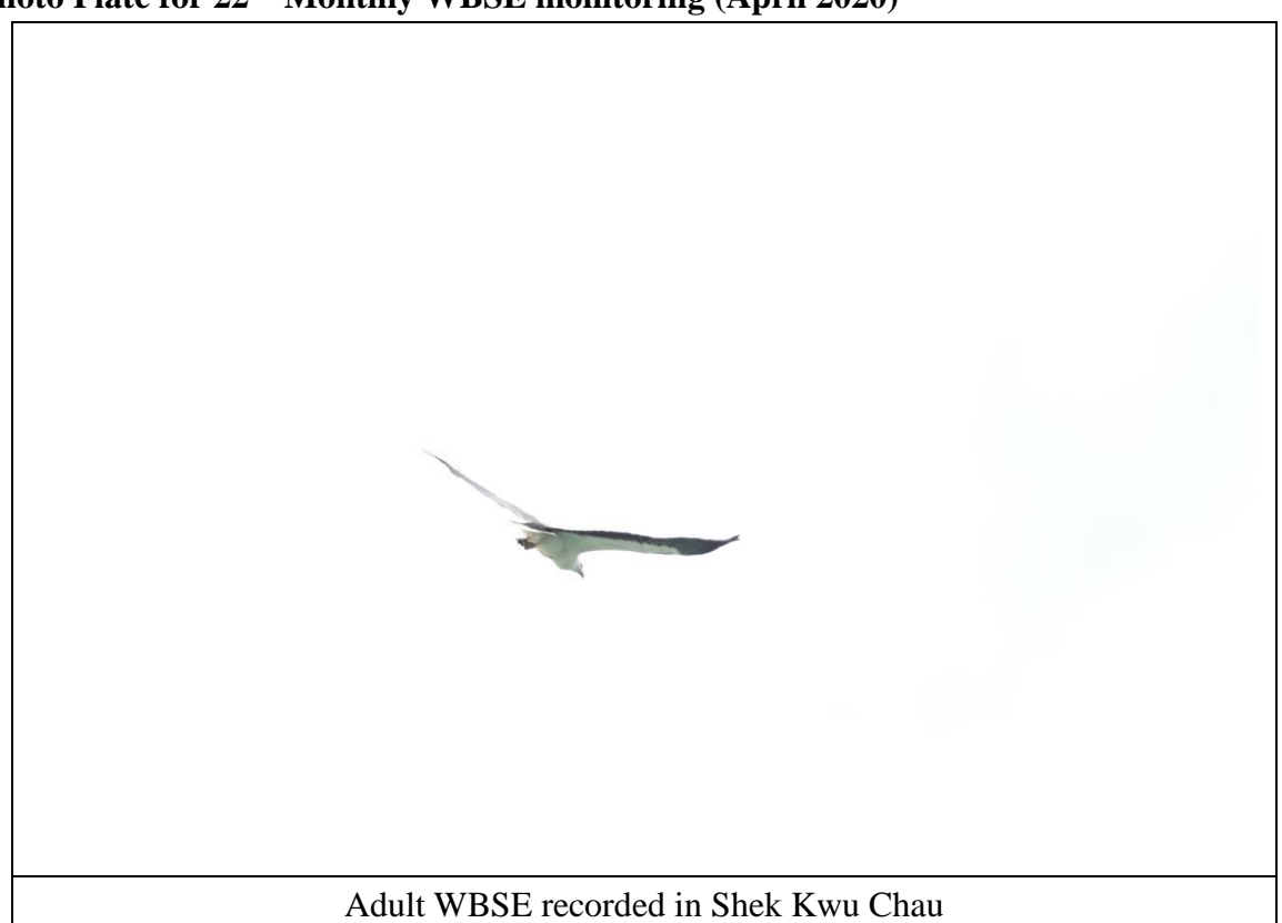
Photo Plate for 22<sup>nd</sup> Monthly WBSE monitoring (April 2020)