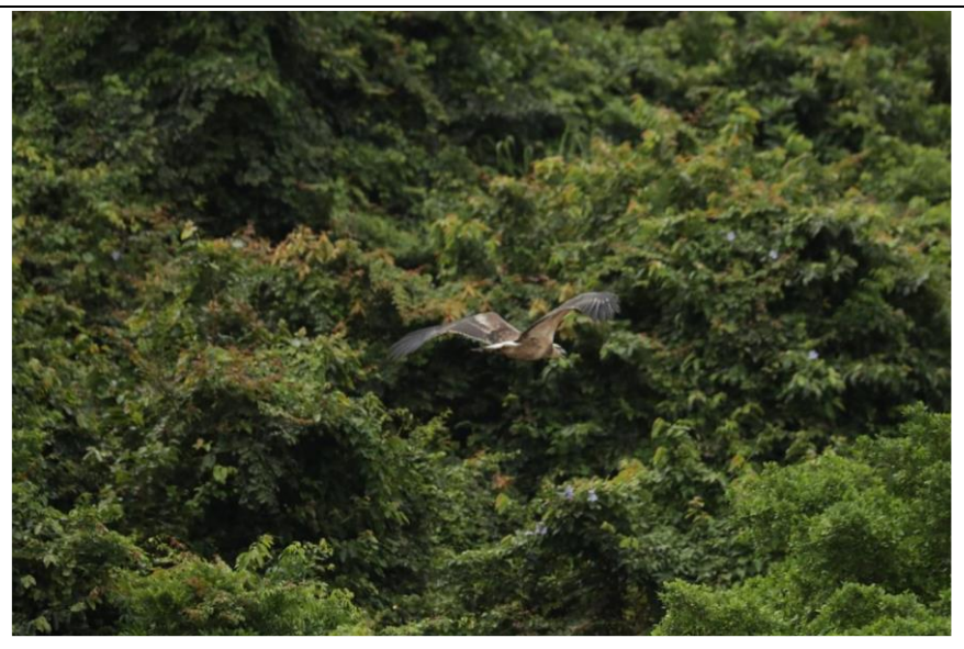
WBSE juvenile flying along the area next to the nest