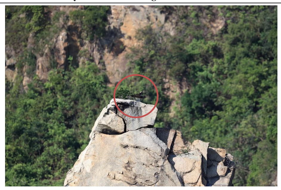
Adult WBSE recorded in SKC