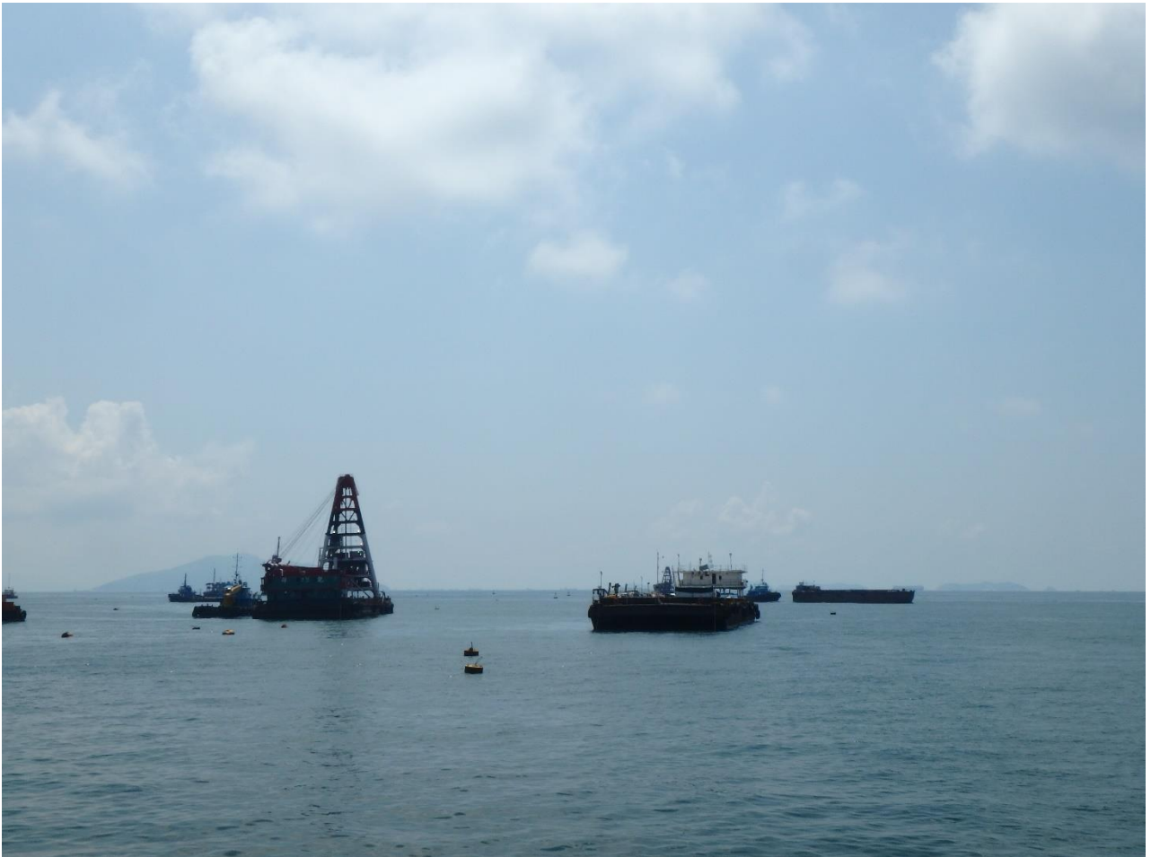
Photo records of Vessel-based Line-Transsect Survey Effort during the reporting period