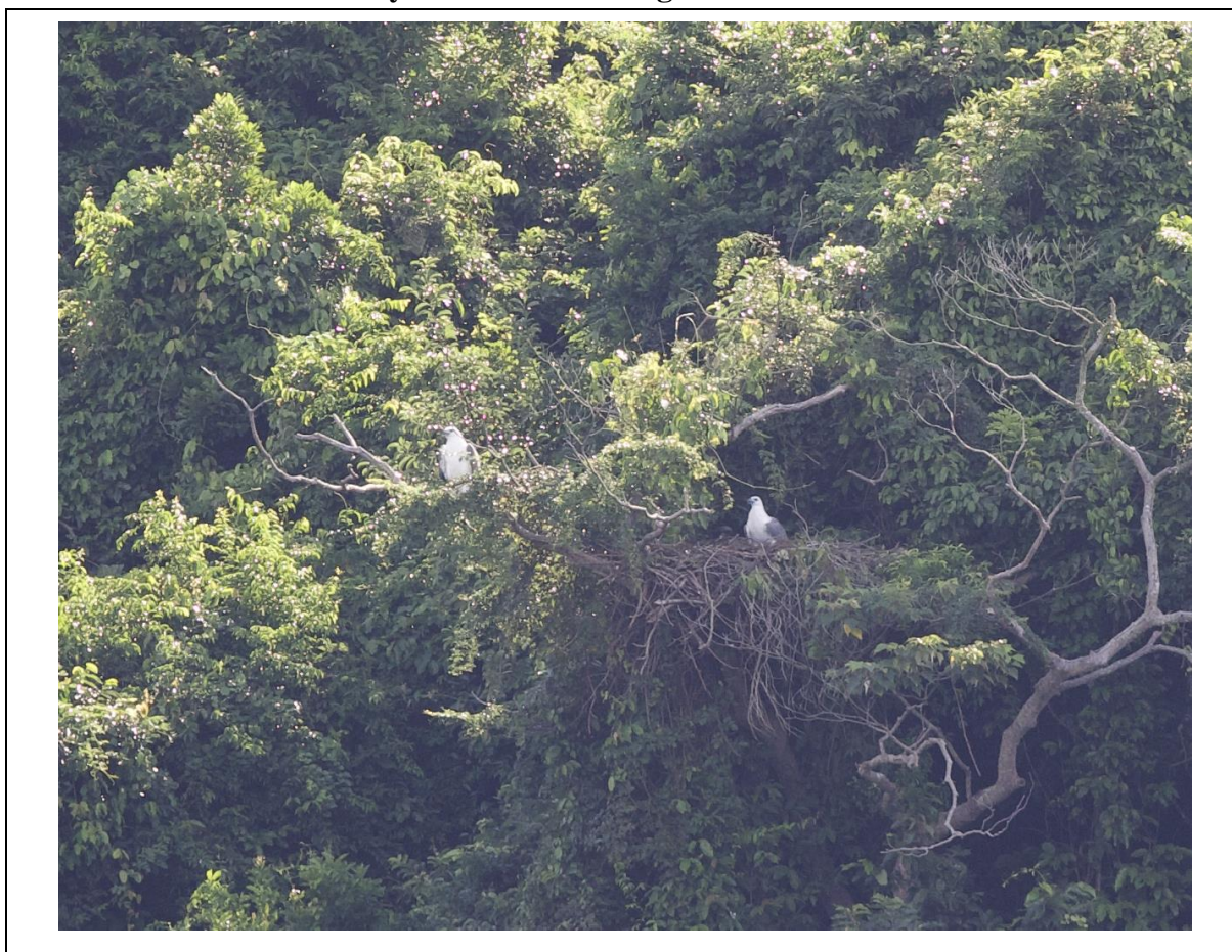
Adult WBSE Recorded in Shek Kwu Chau on 21 September 2021